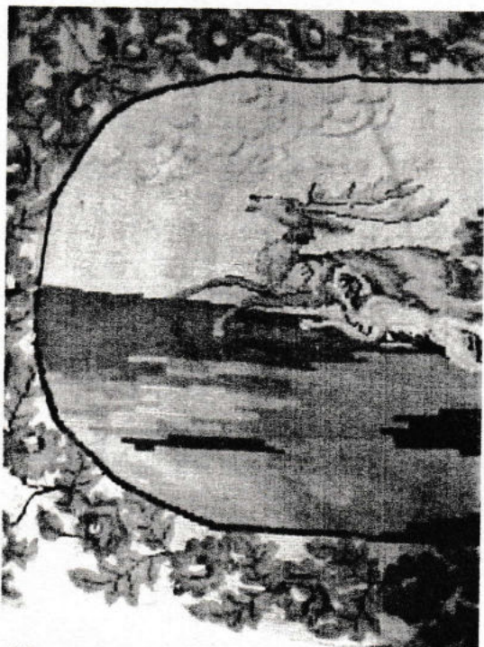
Moore carpet, Collection of the Clinton County Historical Museum