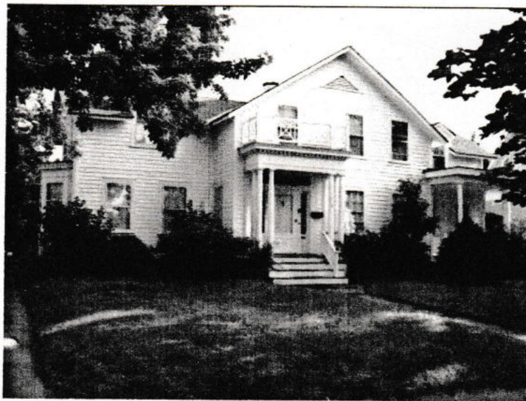
The Saily Warren House, 3 Cumberland Avenue, Plattsburgh