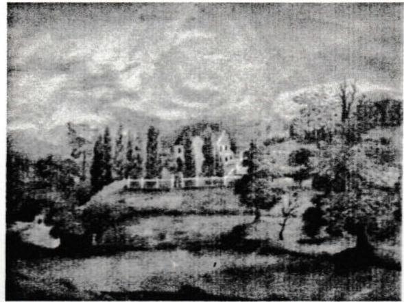
Pliny Moore House in Champlain, 1829, Collection of the Clinton County Historical Museum

idea of embroidering a carpet for the drawing-room, which was about twenty feet square. Although every article to be used was raised on my grandfather's estate, from the wool on the sheep through the process of manufacture, to the coloring of the soft flexible yarn for the embroidery shading in the greys, browns and greens; there was no canvas suitable to be obtained at home, it being necessary to have strong texture, with firm square mesh to make a perfect cross-stitch, and so the material was sent for from Montreal.