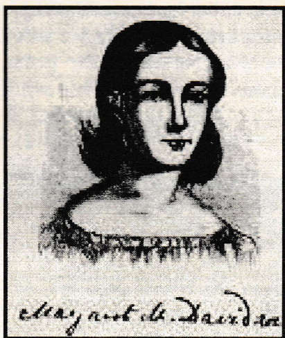
Margaret Miller Davidson