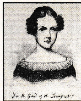
Lucretia Maria Davidson

Soon after, their mother sought to publish a larger volume of Lucretia's work entitled Poetical Remains of the Late Lucretia Maria Davidson , 1843, which she dedicated to Washington Irving in thanks for his encouragement of her two gifted daughters.